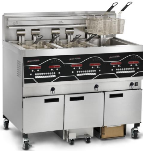
EEE 143 3-well open fryer